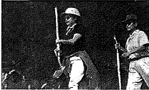
Marginal Eyes.